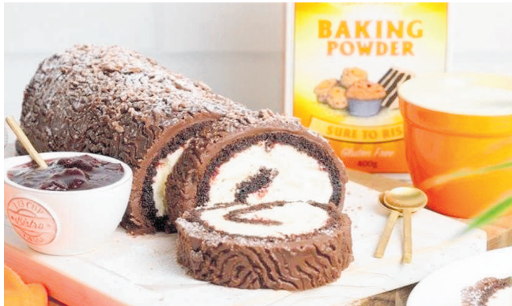
Chocolate logs, an oldie but a goodie.

The Christmas trend for many is expensive gifts and buy now and pay later options. But in reality, that is totally not necessary. The gift of family, of happy