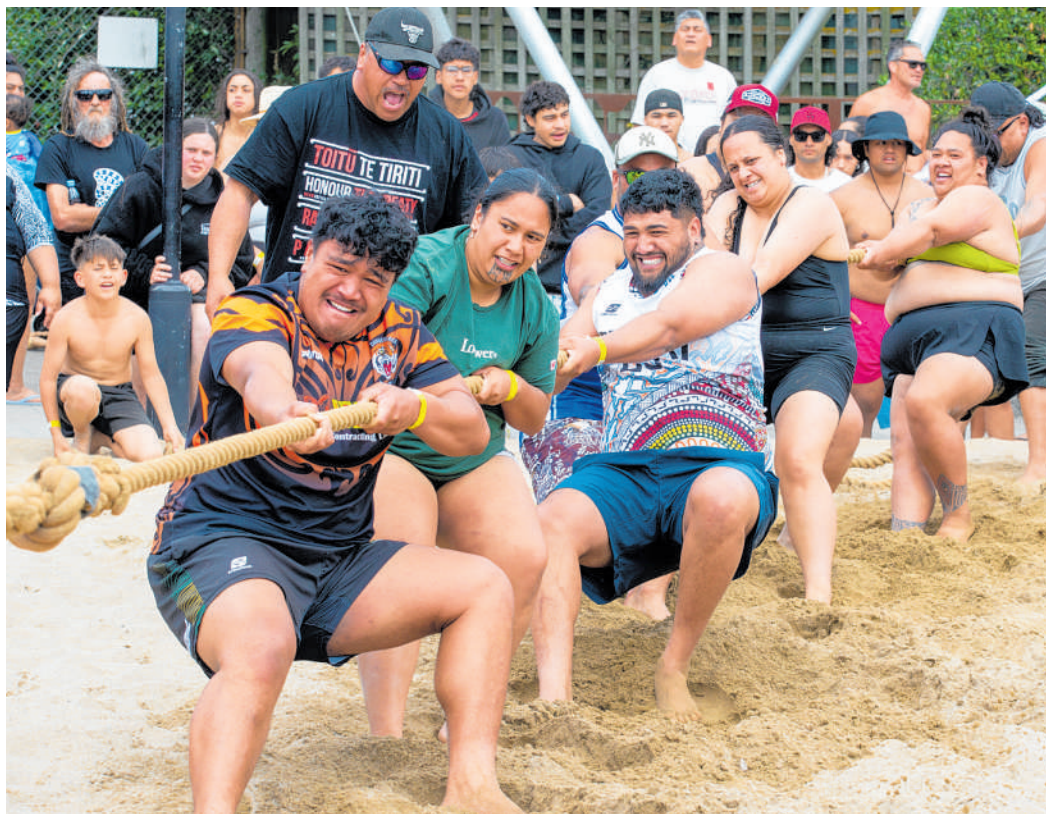
Whanaungatanga was the main theme as sports returned to the agenda at Ngāti Kahungunu's 18th annual AGM Pā Sports Day.