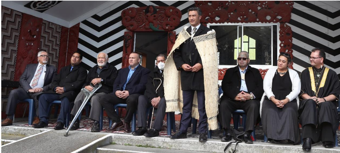
NKII Board Pōhiri 2022, Waipatu Marae