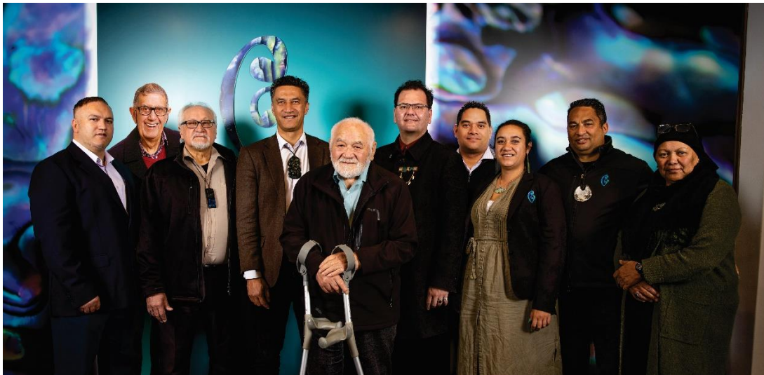
NKII Board Photo 27 September 2024